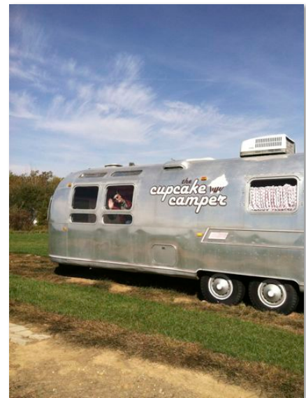
"The Cupcake Camper" - one of many marvels at Dan Pipers' Vintage Campers.