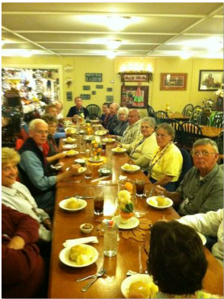
The Apple Dumpling Gang at McClure's Tate Orchard near Peru.