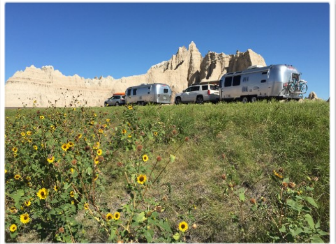
Entering Badlands National Park