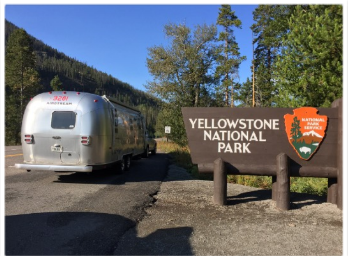
Entering Yellowstone National Park