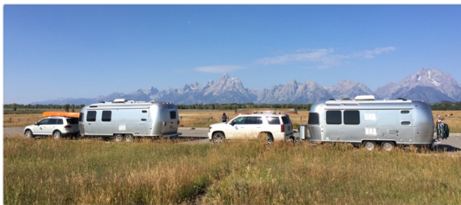
Grand Tetons National Park