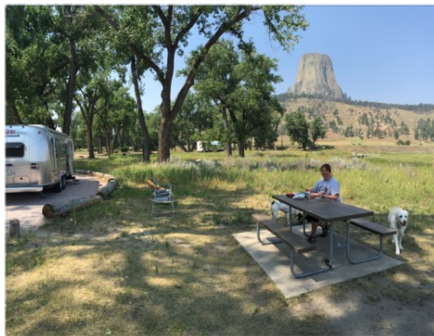
Devil's Tower National Monument