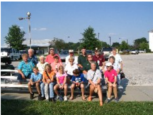
This picture, from the Archives, is of the group attending the August, 2006 Rally at Odon, IN