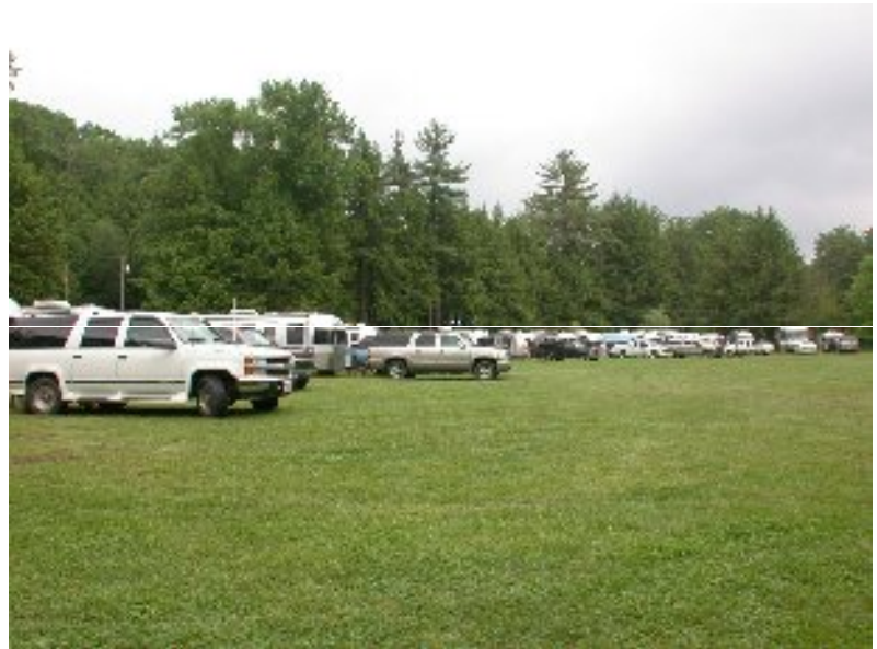
CIU Caravan to Burlington VT 2003 International Rally makes an overnight stop