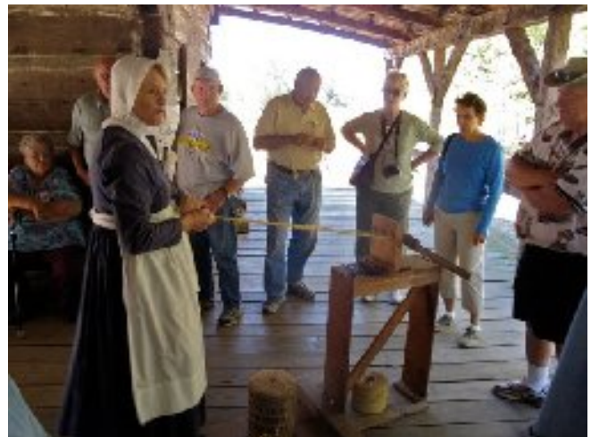
A tour at New Harmony, IN