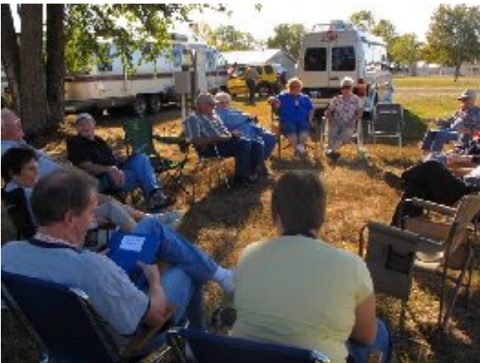
Caravaners meet at Madison, IN

This being our first "come and go" caravan we learned a lot about how to make our events as accessible to ALL our members, not just retirees with unlimited time. Ultimately, we met our goal of more fun, more fellowship and more adventure for MORE members. That is, after all what the Wally Byam Caravan Club International is all about.