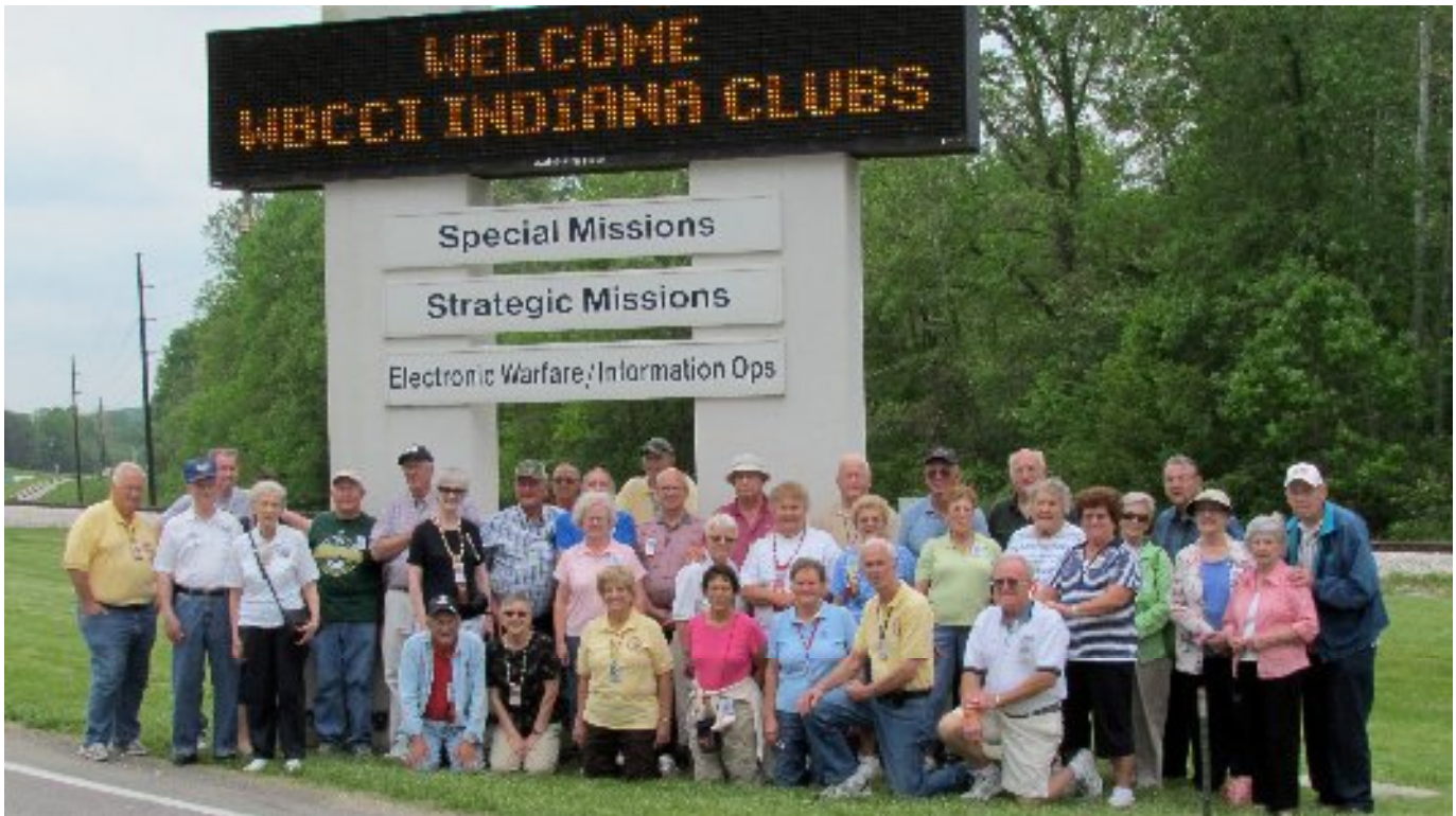
This is the group of happy campers at the NSWC Crane Division, It was nice of them to put our name up in lights.