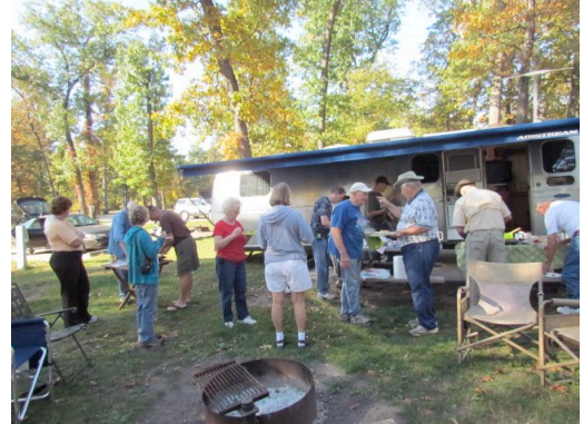
Some candid camera shots from the Fall Caravan across northern Indiana.